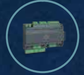
CO 2 SCROLL BOOSTER CONTROLLER (XC PRO) Refrigerant circuit management Smart control Protection Diagnostics Communication