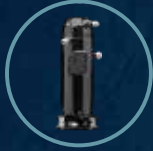
CO 2 SCROLL COMPRESSOR Variable and fixed speed Medium and low temperature High and low standstill pressure design