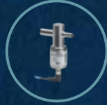
EXPANSION VALVE (CV) Gas cooler & flash tank Pressure control Desuperheating valve