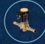
SOLENOID VALVES Dynamic Vapor Injection (DVI)