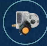
OIL LEVEL MANAGEMENT (OMS) Compressor Oil separator Flash tank