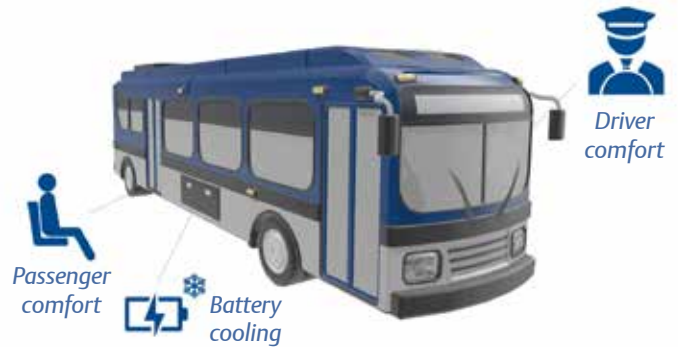
Copeland scroll compressors provide bus passenger comfort as well as battery cooling

Emerson provides solutions with a cooling and heating capacity of 7 - 35 kW for the air conditioning of traditional buses, as well as for electric buses. Heat pumps with the natural refrigerant R290 are ideal for electric buses.