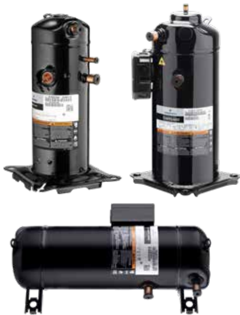
Copeland scroll vertical and horizontal compressors

Reaching Efficiency Targets Throughout the Cold Chain