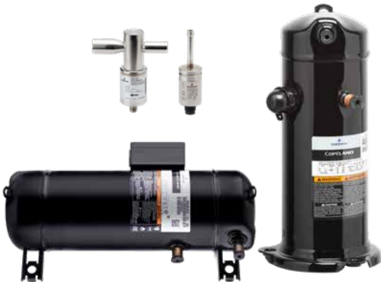
Copeland scroll vertical and horizontal compressors and flow controls

Copeland™ Scroll Compressors - Innovative, Reliable, High-Performing