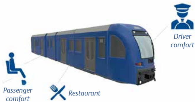
Copeland scroll compressors provide comfort throughout trains

We offer a wide range of vertical and horizontal scroll compressors. Because of the need to switch to alternative refrigerants with a lower GWP, Emerson provides alternatives for medium or low-pressure refrigerants as well as solutions for R290.