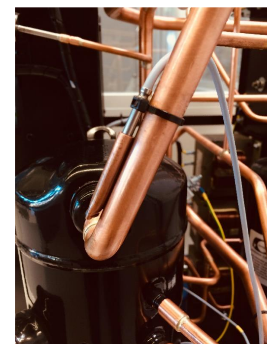
Figure 1: Discharge line temperature sensor