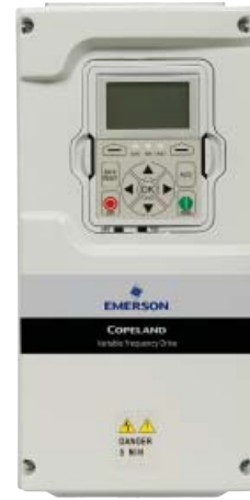
Copeland commercial HVACR variable frequency drive EVM Series

The EVH VFD series, covering 1 to 250 HP, has three phase options including 575-volt and expanded control functions to handle applications requiring more advanced control functionality.